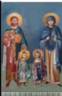
St. Eustathios & His Family Donation $17,000.00