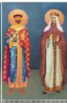
St. Nicholas & St. Alexandra Donation $15,000.00