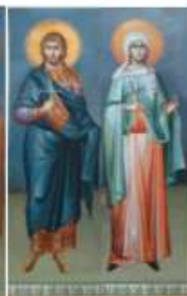
St. Terentios St. Neorilla Donation $15,000.00

The Saints above will be placed on the northeast wall outside and above the bride room windows.