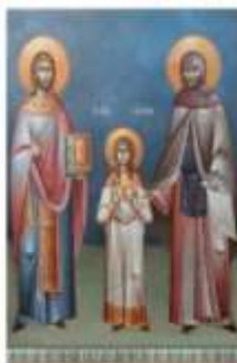
Sts. Nicholas, Rafael, & Irene. Donation $15,000.00

Donation - $12,000.00 Philoxenia of Abraham