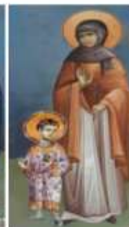
St. Julitta & St. Kyrikos Donation $10,000.00