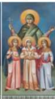
St. Sophia & Three Daughters Donation $15,000.00